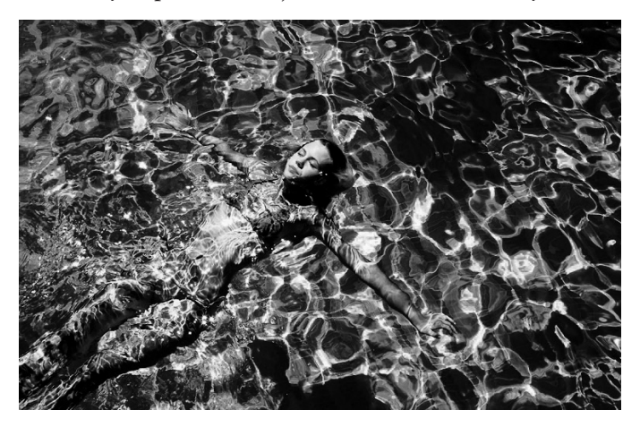
Figure 1: Undulating Skin in the Swimming Pool

the many different attitudes that surfaced in our work...; transposing them into different areas, seeing how they looked in different contexts, reversing them, trying to invert them.<sup>231</sup> As suggested above, such experiments pay close attention to "the material" as a strategy for "taking account of the distinctive kinds of effectivity that material objects and processes exert as a consequence of the positions they occupy within specifically configured networks of relations.<sup>232</sup> Agency in a new materialist frame is always a matter of intra-action:<sup>233</sup> "what [matter] is able to do , inevitably depends on adjacent matter that it may do something with ."<sup>234</sup>