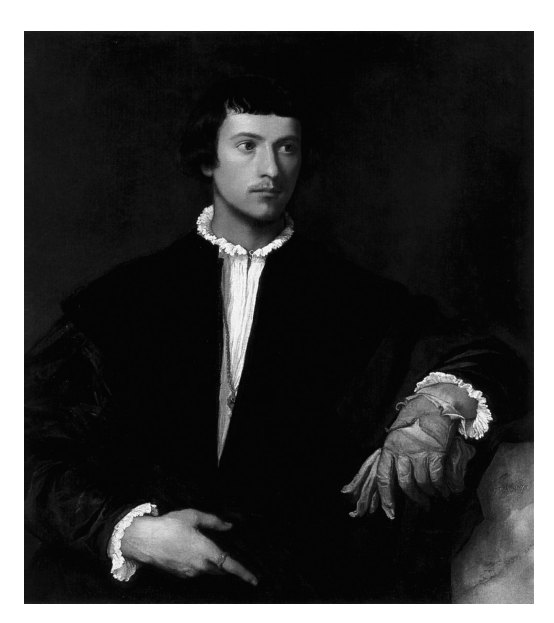
Figure 2: Man with a Glove (Titian, c. 1520)

In the presentation, the re-enactment story was written by another group member and focused not on the agency of skin, but on the gloves that cushioned it. It was preceded by the display of a painting by Titian (Figure 2). The